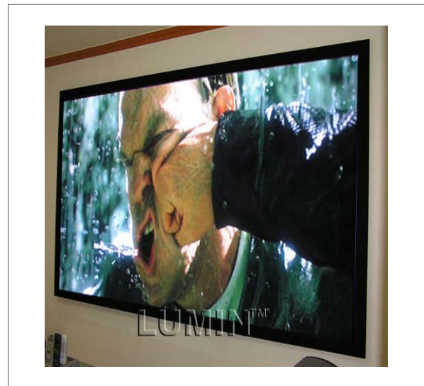
Delivering IMPACT—LUMIN Silver Ultra

The display has a homogeneous, non-structured display surface which is tough, resistant to scratching, and weatherproof, while still providing vivid, dynamic images.